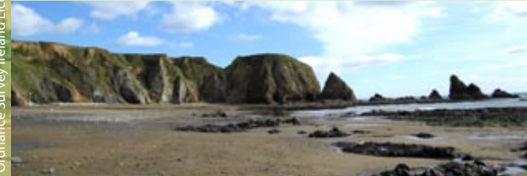
> Benvoy strand

➤ Walk 1 - Beaches - about 3km Walk up the hill from Annestown to the west. Take the first left turn as the road bends left and walk down to the peaceful Benvoy Cove. Returning to the road turn left and walk about a kilometre, enjoying the coastal scenery as far as the little fishing harbour at Dunabrattin/Boatstrand. It is probably nicest to return the same way to Annestown for the other side of the view although variations are possible taking the inland road and bearing right each time.