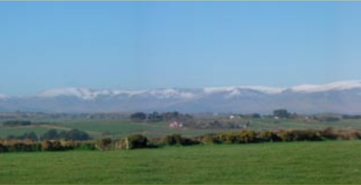
> The Comeraghs (above), Anne river valley (below)

Walk up the hill from the village to the west and passing the turn left to Benvoy Cove and the B&Bs on the right, turn into the boreen (untarred road) on your right shortly after starting to go downhill. This leads atmospherically for over a kilometre, with fine views of coast and Comeraghs. Reaching another public road, turn right and about ½ km further right again return to Annestown. Variations on this are possible by going left for Boaststrand and back along the coast road.