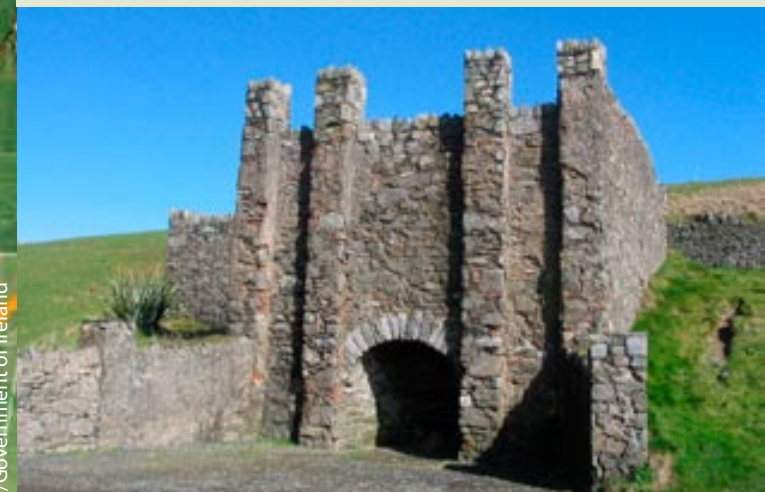
> Lime kiln on Annestown beach car park

➤ Annestown walks begin at the car park The castellated structure at the south-eastern end of the car park is the remains of a lime kiln, where limestone was heated until it crumbled and was then used for fertilising the land. Here an information board explains aspects of the local geology. The Copper Coast table is sited to enable the sea views here to be enjoyed and the information board explains the local geology.