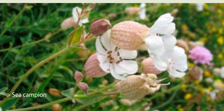
> Sea campion

From Fenor towards Kilfarrasy (as before), look out for a lane going right. Follow it uphill to reveal magnificent coastal and mountain views. With luck you might see a peregrine falcon. Look out for yellow hammer, gold-, green- and chaf-finch, robin, wren and thrush. On the ditches facing the sea you will see thrift, herb robert, yellow stonecrop, rock rose, plantain, sea campion, sea spurge, wild rose, saxifrage and many others. This unspoiled lane swings right and down onto the main road. Go right to Fenor.