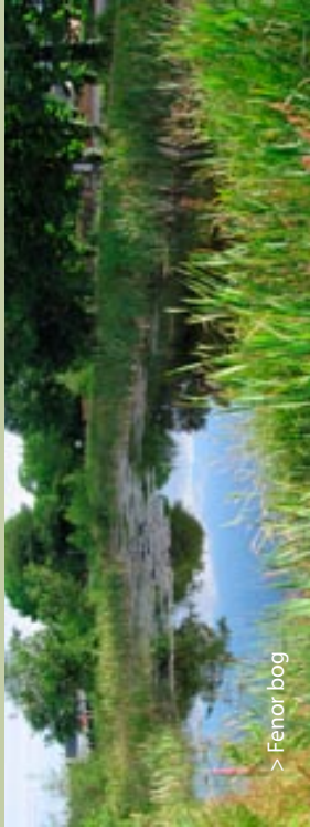
> Fenor bog

As above, from Fenor take either road at the first Y-junction and continue about 50 meters beyond where they rejoin take a lane to the right for Carrickavantry Lake with fishing for brown and rainbow trout. Look out for swan, heron, kestrel, hen-harrier and sparrowhawk as one walks to one side of the lake. Beyond it, at a left-hand turn, over the ditch is a small 4000 year old passage grave. At the end of this lane the way swings left and then right onto the tarred road across an interesting bog. Turn right at the crossroads for Fenor. As this can be a busy road in summer, a quieter option would be to go straight, turn right and right again at the two T-junctions, adding about 2 km to the journey.