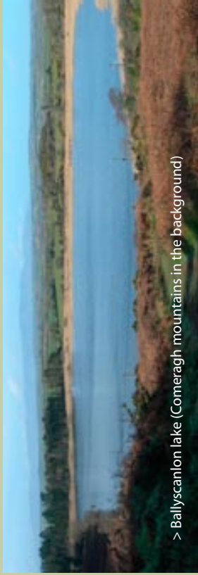
> Ballyscanelan lake (Comeagh mountains in the background)